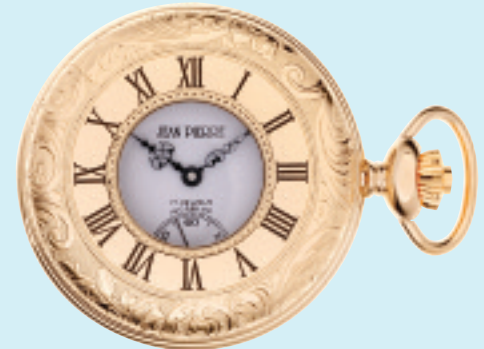
Eng Turned Half Hunter Roman Dial