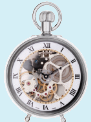
Open Face Skeleton with back Stand GP WW1752 CP WW1753