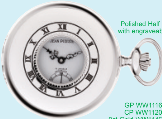
Polished Half Hunter with engraveable back