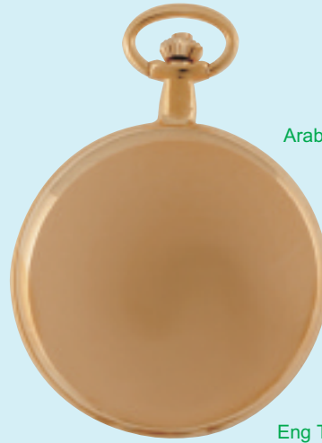
Polished Full Hunter Arabic Dial, Engraveable back

This Polished Full Hunter Pocket Watch with an Arabic Dial is available Mechanical movement, CP and GP or 9ct Gold