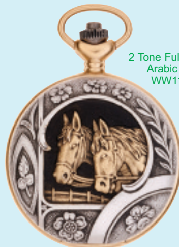
2 Tone Full Hunter Arabic Dial WW1153