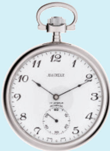
Open Face with engraveable back GP WW1111 CP WW1149

Many of the models on these two pages are also available with Masonic dials